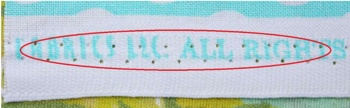
White stripe with letters